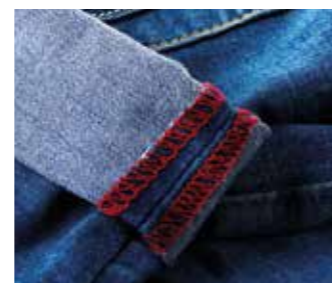
Different kind of sewing on demand