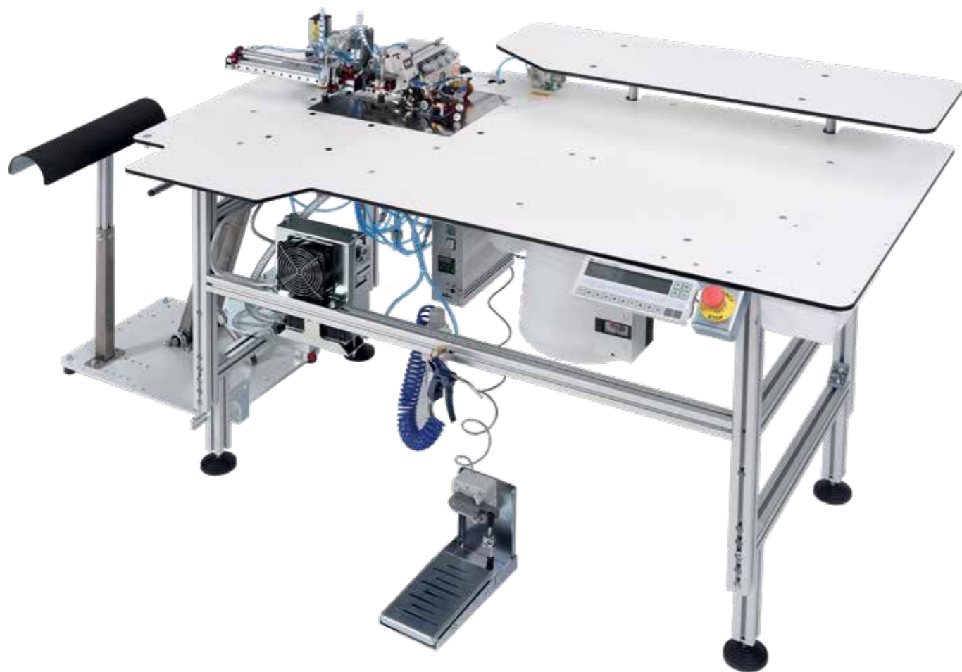
SGSP5214 Sewing Unit

The unit perfectly works in automatic mode with big curve or skinny shape of garments, light stretch or heavy fabric, different thickness on front and back panels. Full guarantee of the leg measures. One operator can manage 2 units! SGSP5214EV2: a new upgraded version with patented device for serging operation "push up" pants.