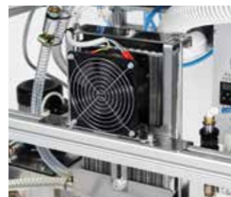
Oil cooling device