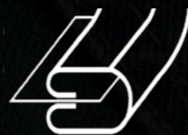
Single straight waistband style