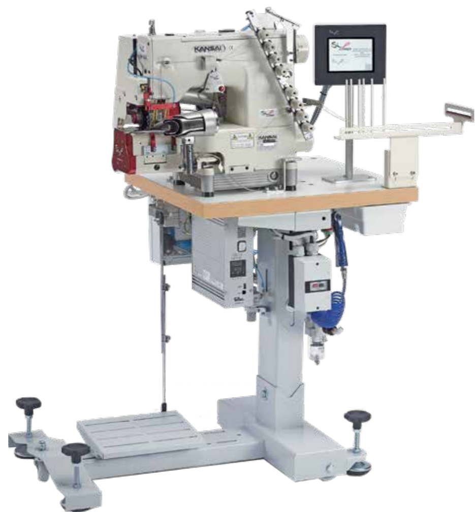
6044-SPVCH Sewing Unit