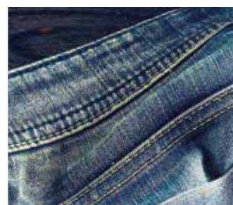
Anatomic Banana Shape