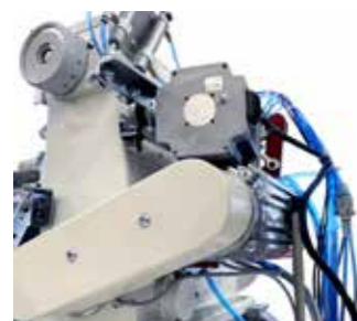
6044-DIVA one step motor