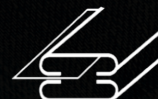
Double straight waistband style