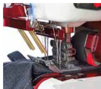
Triple electronic puller device