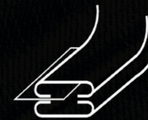
Double curved waistband style

By changing the folders, the user can attach different waistband style and size